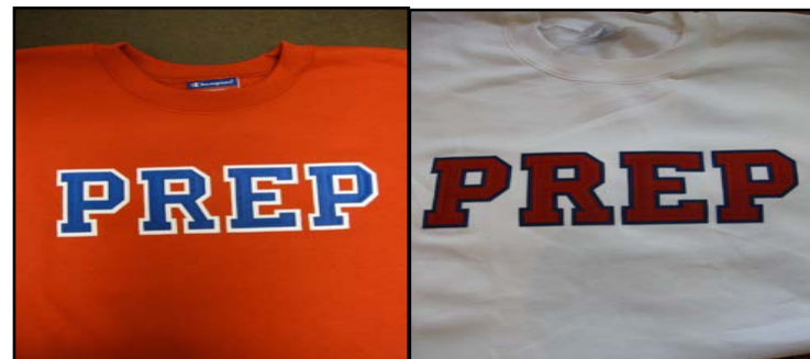
SWEATSHIRT (ITEM 109) $45 plus tax SPECIFY RED OR WHITE YOUTH: M L XL ADULT: S M L XL 2XL