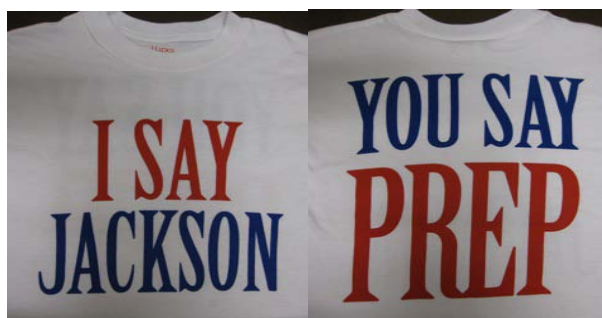
I SAY JACKSON/YOU SAY PREP (ITEM 106) $15 plus tax YOUTH: XS S M L XL ADULT: S M L XL 2XL 3XL