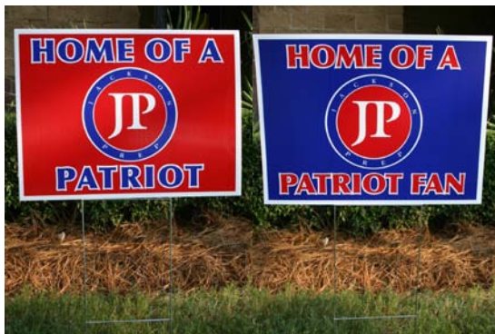
YARD SIGN (ITEM 110) $15 plus tax Home of a Patriot (front) Patriot Fan (back)