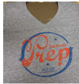
V-NECK CONCERT T (ITEM 103) $24 plus tax XS S M L XL 2XL *runs small