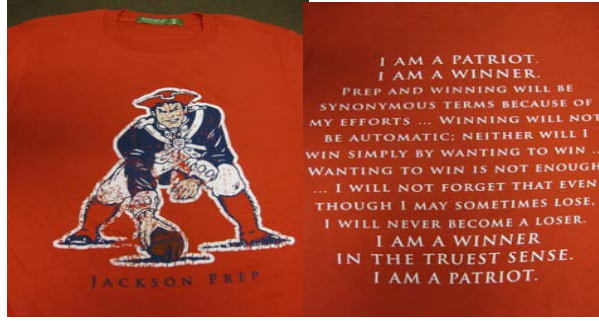
RED PATRIOT MAN (ITEM 102) $24 plus tax XS S M L XL 2XL 3XL *runs small