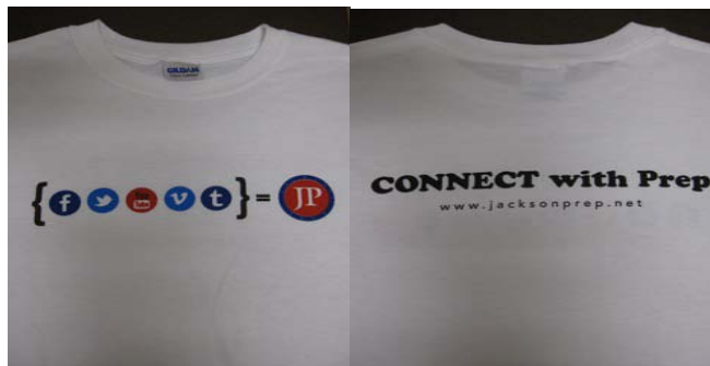
CONNECT WITH PREP (ITEM 108) $15 plus tax YOUTH: XS S M L XL ADULT: S M L XL 2XL 3XL