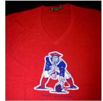
V-NECK PATRIOT MAN (ITEM 104) $24 plus tax XS S M L XL 2XL *runs small