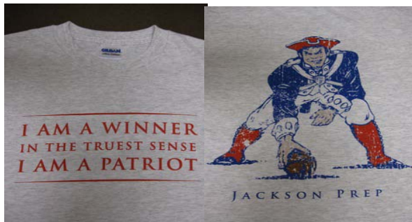
I AM A WINNER (on ash grey) (ITEM 105) $15 plus tax YOUTH: XS S M L XL ADULT: S M L XL 2XL 3XL