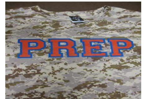
CAMO T (ITEM 107) $15 plus tax YOUTH: M L ADULT: S M L XL 2XL *runs small